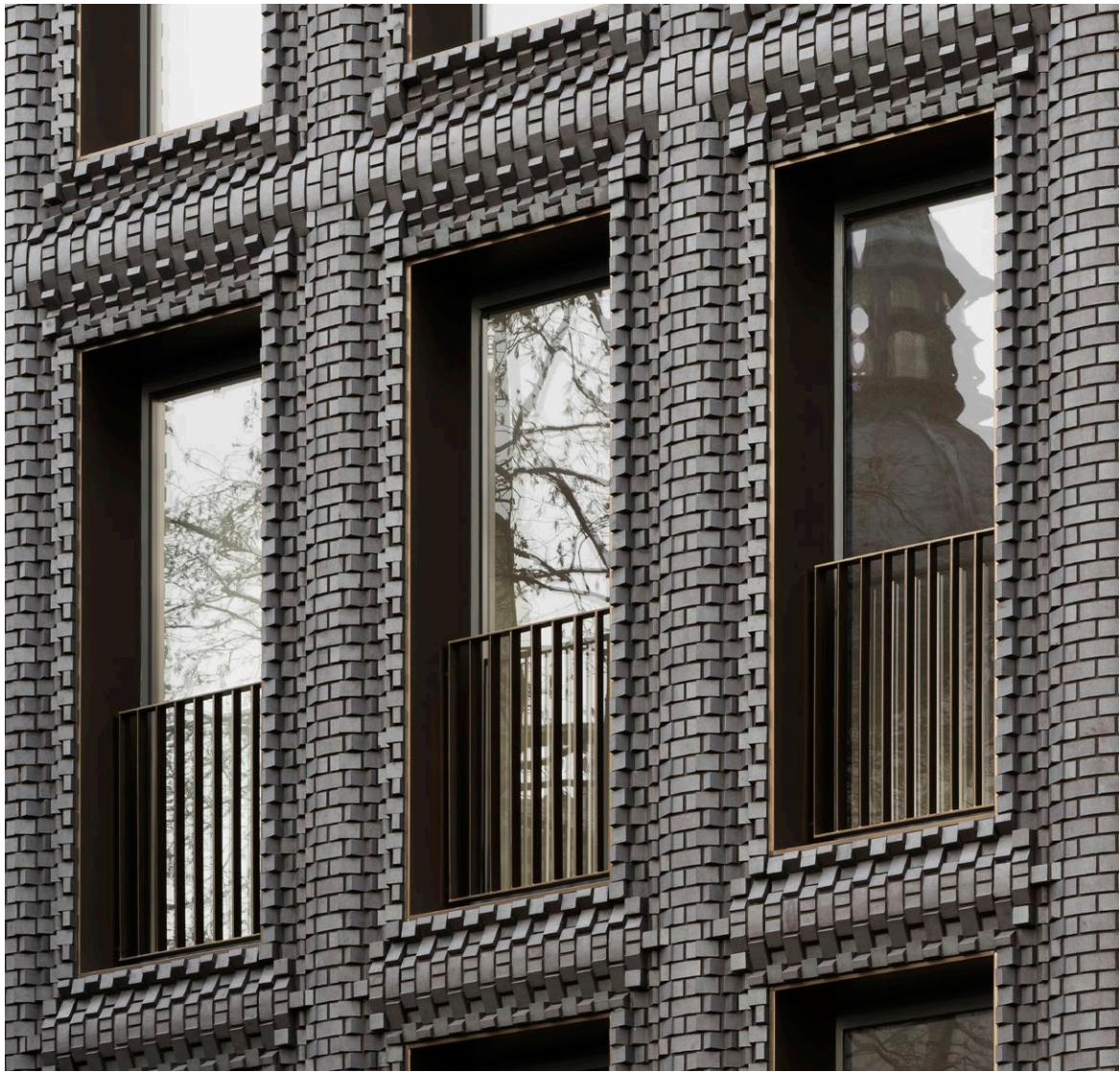
Pictured above: The Interlock

While mass-produced clay bricks dominate, look at most clay brick buildings and you will see much more than rectangular clay bricks. Clay's extraordinary versatility means it can be worked and moulded to create unique brickwork features and detailing for restoration projects, or to add a finishing touch to a new build of any architectural style. It is this versatility that makes clay brick a popular choice for architects. The award-winning Interlock building in London is an example of the transformative effect of clay brick. Designed and produced by Cradley, UK brickmaker Forterra's special shaped brick facility, the complex construction of this clay brick façade brought together 5,000 bespoke Etruria clay blue bricks which were expertly laid using course by course drawings to form the three-dimensional, interlocking pattern.