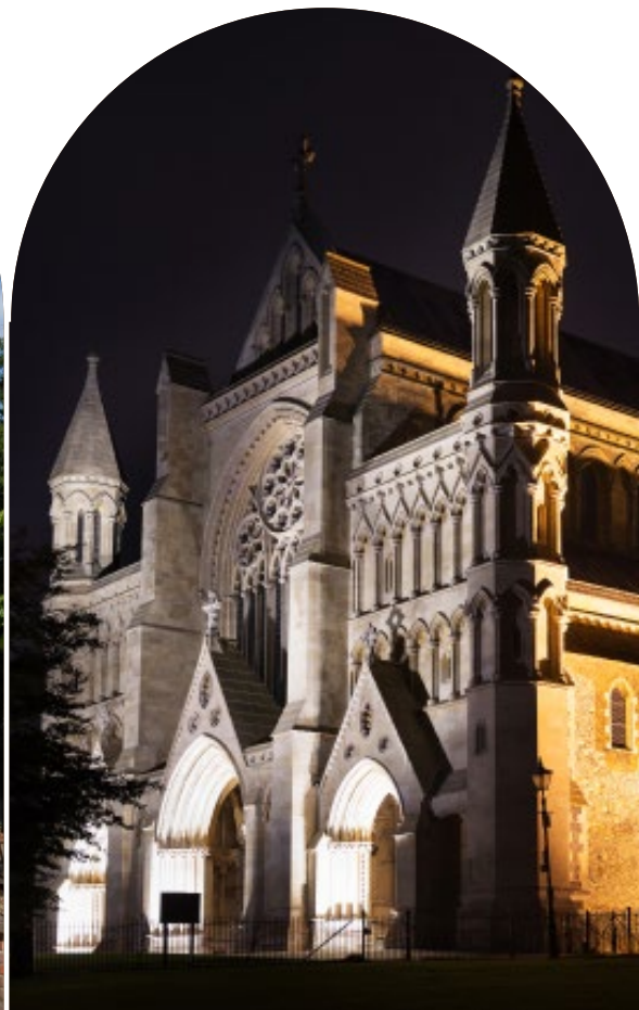
Pictured above: St Alban's Cathedral