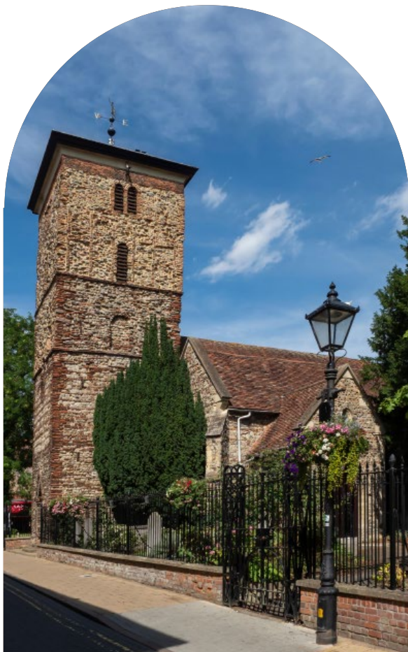
Pictured above: Holy Trinity Church

"Both of these buildings have been standing for a thousand years, using bricks from buildings built a thousand years before them, and are testament to the durability, longevity and inherent sustainability of clay brick."